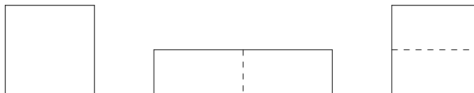
FIGURE 1. Baker's transformation

Pictorially, see Figure 1, the transformation is reminiscent of kneading bread. The entropy of the baker's transformation is \log_2 2 .